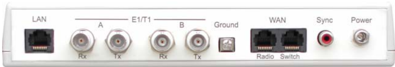
Model NX-2E1/T1-U shown above. Model NX-2E1/T1-B has two RJ48 instead of four BNCs

The NetCrossing™ gateway can also be paired with third party Ethernet high speed radios to deploy E1 / T1 wireless links for a fraction of the cost of an equivalent microwave transmission system.